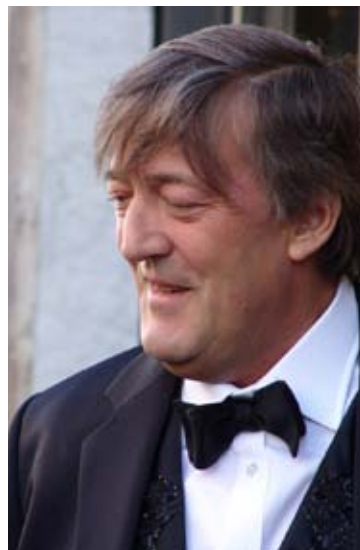
Stephen Fry’s nervous breakdown made headline news in 1995 after he disappeared for several days.

British people are currently experiencing the biggest squeeze on their incomes since the second world war. Whilst the financial meltdown started in 2008, it is only now many of us are really feeling the pinch and it would seem there are several more years to come. This has all come about as a result of many things – rising inflation, tax increases, benefit changes, soaring household bills and minimum if any pay increases.