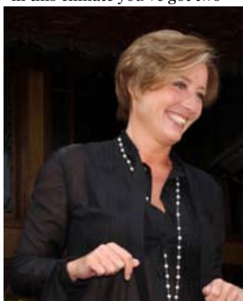
Emma Thompson says work saved her from ‘going under’ in her battle with depression.