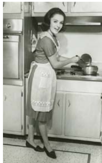
Don't forget to put a lid on it...

Reduce your hot water thermostat – most people have it set to high - 60°C/140°F is fine for bathing.