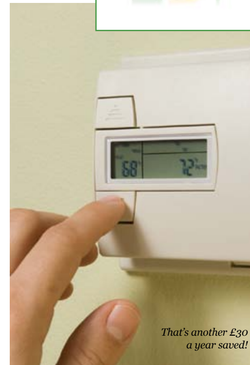
That's another £30 a year saved!