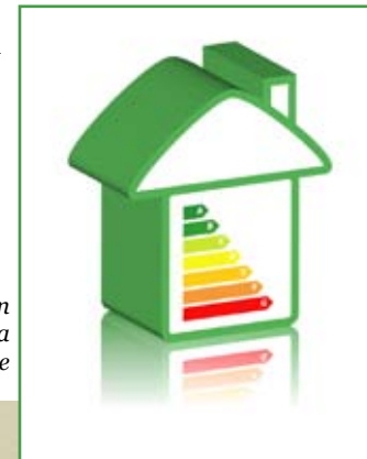
A green home is a happy home

If you have not changed energy providers in a while it may be worth checking with a comparison site to see if you are on the best tariff for your area and usage. Check whether discounts are offered for dual fuel and paying by direct debit.