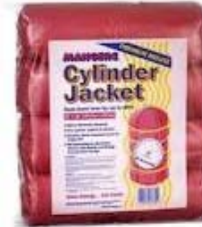
When it's cold, put your jacket on...

If you have a hot water tank – get a lagging jacket and insulate pipes.